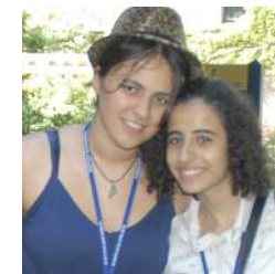
Above: details from W2W trolley ride through historic Boston; delegates pause at Wheelock College.