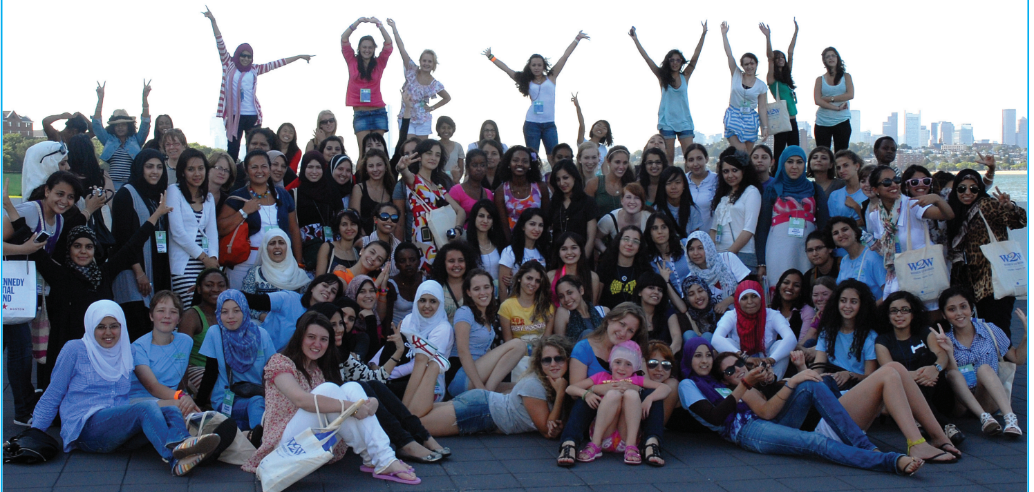
Women2Women 2010 delegates gather outside the John F. Kennedy Library following the Empower Peace – Al-Arabiya Electronic Town Meeting.

Continued on page 2, Letter from the Founder