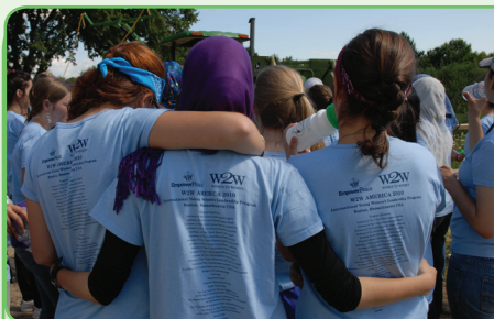
New friends embrace after a rewarding day of service-learning at the Community Harvest Project in Grafton, Massachusetts.

Empower Peace will release its first in a series of "EP Times: Monthly Updates" in an effort to maintain a steadier stream of communication with Women2Women alumni. Each publication will be a brief summary of any relevant Women2Women Program updates, opportunities and news about your fellow W2W alumni! With this in mind, if there is anything that you as an alumna would like to relay to your friends around the world – such as a significant personal achievement or opportunity to become involved with a project – please send your updates to Krisanne at kcampos@empowerpeace.org . We look forward to hearing from you and sharing all of the amazing achievements of you and your peers.