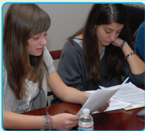
Two students from the Beaver Country Day School study their presentation for Videoconference #1.

With a grant from the US Department of State's Bureau of Educational and Cultural Affairs, Empower Peace launched its newest Virtual Connections initiative in September 2010. The Global Impact Apprentice Challenge, or GIA, presents the opportunity for American high school students to collaborate with a partner school in the Middle East or North Africa on a service-learning project addressing an environmental issue of mutual concern in each of their communities. Through digital communication, joint service-learning initiatives and cultural exchange, this program provides a unique forum for youth to collaborate on issues of both local and global concern.