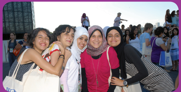
Algerian, Kuwaiti, and Egyptian delegates enjoy the sunset over Boston outside the JFK Library.

We are excited to announce that Empower Peace's second Women2Women Alumni Conference is in the planning states for Summer 2011 in Morocco, with dates TBD. Please keep on the lookout for a survey regarding potential conference dates. We are eager to hear from all of you, and we will be in touch with further details as they become available.