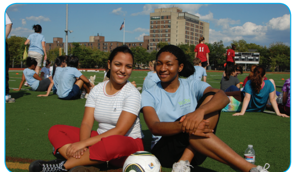
Delegates, take a break during Soccer1's community building soccer clinic.

EP NEWSGRAM is published by Empower Peace.