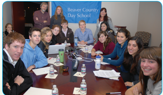
Beaver Country Day School students gather for the first videoconference in the Global Impact Apprentice Challenge program.

Beaver Country Day School in Chestnut Hill, Massachusetts and Sadat City Languages School in Sadat City, Egypt are collaborating on ideas to structure better waste management systems within their respective communities. "The Lifesavers" from McDowell Senior High School in Erie, Pennsylvania and the Modern Montessori School in Amman, Jordan are focusing on wildlife conservation and preservation issues. Team "H2O and You" from the South Royalton School in South Royalton, Vermont and Shevah Mofet High School in Tel Aviv, Israel are working to reduce water pollution in their local water sources. Following the successful completion of Videoconference #1, Videoconference #2 will air on February 16, 2011 at 8am EST. Please visit the GIA website , to register for