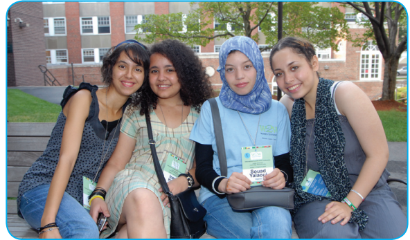
Delegates from Algeria, Israel and Egypt enjoying the Lesley University Campus quad.