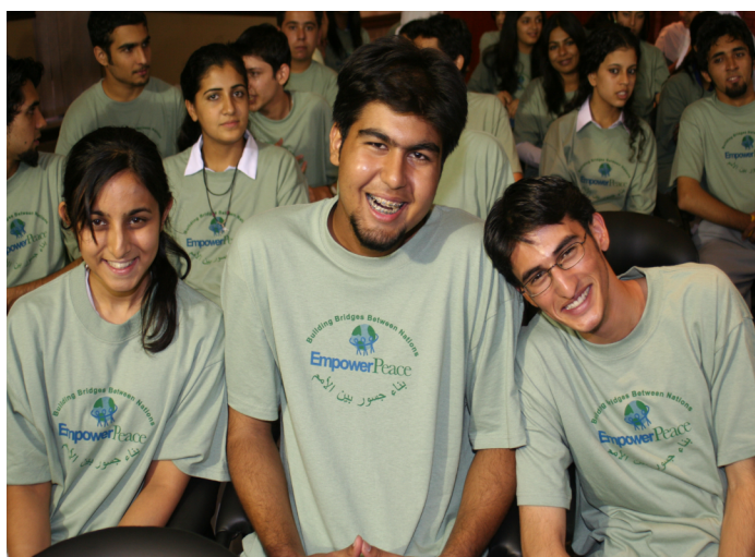
▲ Empower Peace students in Islamabad share a laugh during the conference.