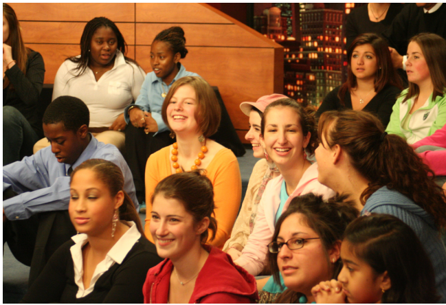
◀ Empower Peace students excited before the telethon

thon was also streamed to classrooms around the world through the Empower Peace website.