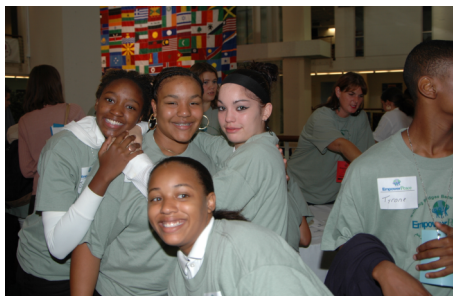
▲ All smiles for these Boston students.

In total, more than 700 students took part in the 90-minute exchange. From New York, Long Beach High School returned for their third Empower Peace conference. In Bos-