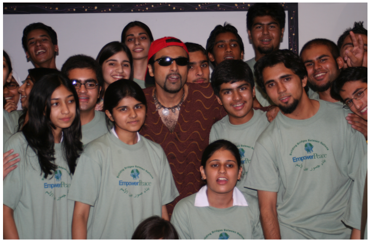
▲ International Rock Star & Empower Peace host Salman Ahmad enjoys a moment with his fans.