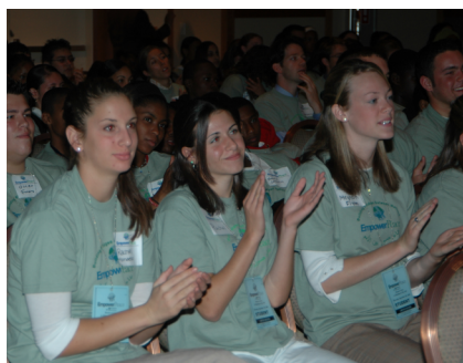
▲ Boston students enjoy the conference.

Musharraf wasn’t the only dignitary present during the conference. Egypt’s Ambassador to Pakistan, Hussein Haridy addressed the students live from