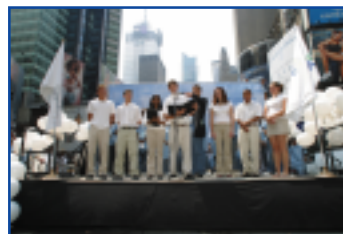
EP New York students read their pledge of peace at the Imagine Peace event.