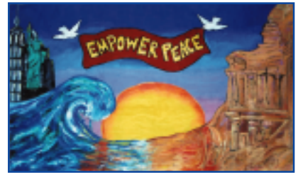
▲ Painting by students at Long Beach High School Art Department.